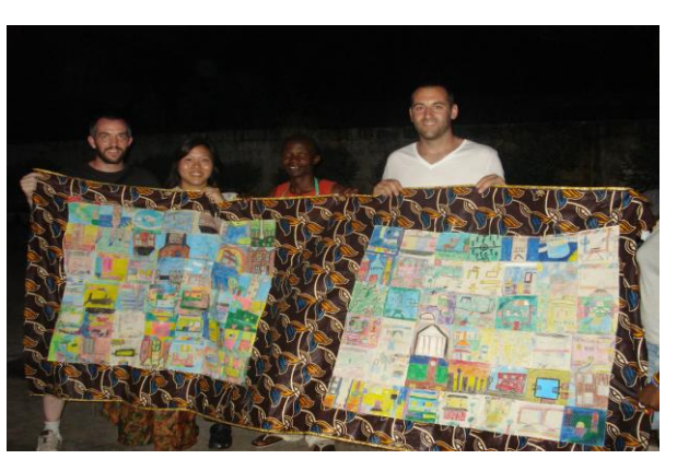
The project was a great success!